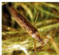
Damsel bug Predator of aphids, caterpillars, etc Available in AUS