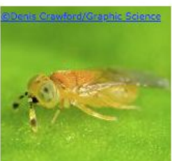
Metaphycus Parasitoid of scale Available in AUS