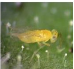
Eretmoceris- Parasitoid of silverleaf whitefly Available in AUS