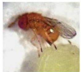
Trichogramma carverae Egg parasitoid of codling moth & LBAM. Available in AUS