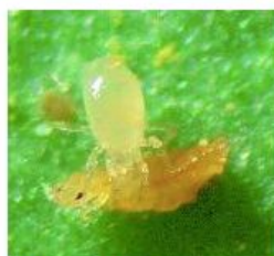
Montdorensis Predator of thrips Available in AUS