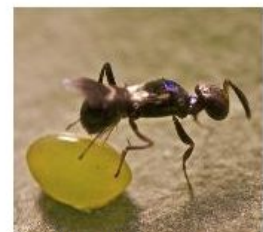
Anastatus -Egg parasitoid of fruitspotting bugs. Available in AUS