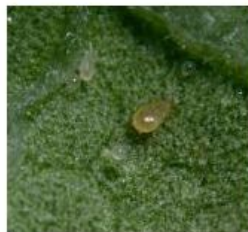
Californicus - predatory mite of TSM and other mites Available in AUS