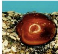
Chilocorus beetles predators of scales insects Available in AUS