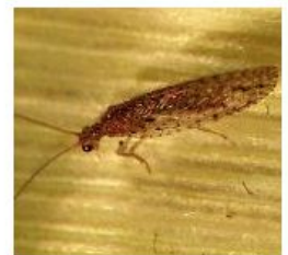
Brown lacewing Predator of aphids, moth eggs etc Available in AUS