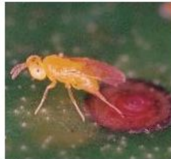
Aphytis Parasitoid of red scale Available in AUS