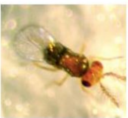
Trichogramma pretiosum Egg parasitoid of heliothis, loopers. Available in AUS