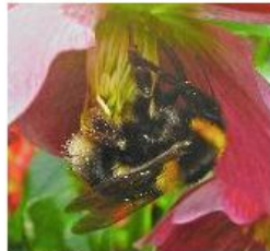
Bumble bees Pollinators Available in NZ only