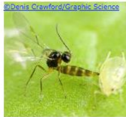
Aphidius Parasitoid of aphids Available in AUS & NZ