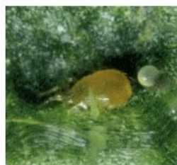
Cucumeris Predatory mite of thrips Available in AUS & NZ