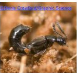
Rove beetle - predator of shore flies fungus gnats, thrips. Available in AUS