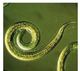
Nematodes- Entomopathogenic parasitoid of various pests. AUS & NZ