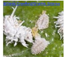
Cryptolaemus- Predator of mealybug, scales Available in AUS & NZ