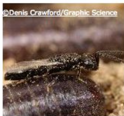
Spalangia - Parasitoid of nuisance flies Available in AUS