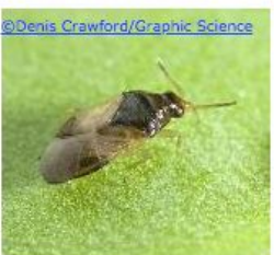
Orius - minute pirate bug Predator of thrips Available in AUS