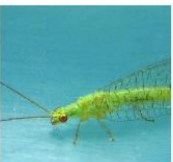
Green lacewing Predator of aphids, moth eggs etc Available in AUS