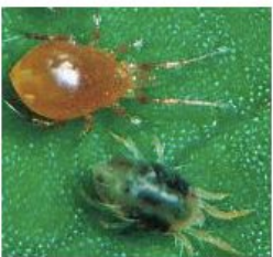
Persimilis (top) - predatory mite of twospotted mite Available in AUS & NZ