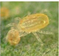
Typhlodromus - predatory mite of twospotted mite Available in AUS