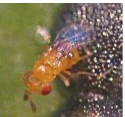
Trichogrammatoidea cryptophlebiae Parasitoid of macnutborer. Available in AUS