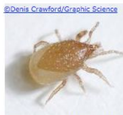
Hypoaspis - Predatory mite of fungus gnats. Available in AUS & NZ